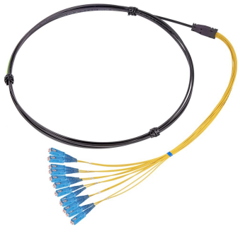
Fiber Optic Drop Cable Assembly for outdoor buried applications